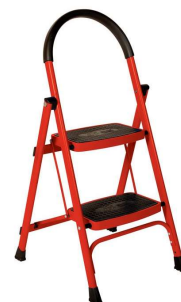
2 Step Ladder